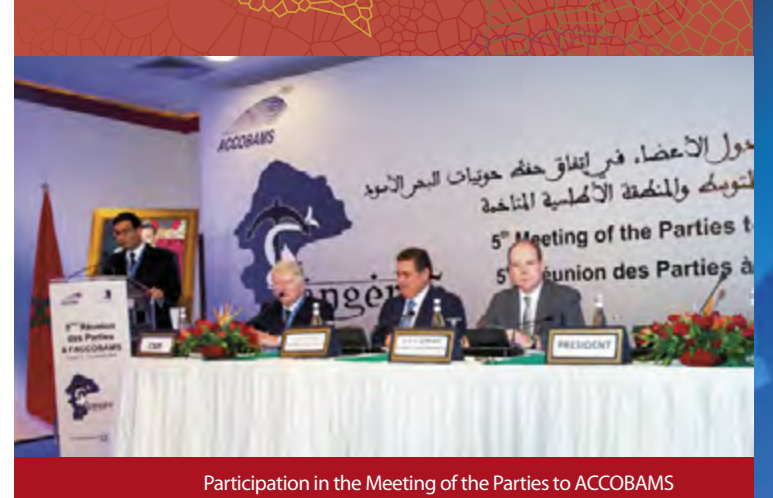
Participation in the Meeting of the Parties to ACCOBAMS in Tangier (Morocco)