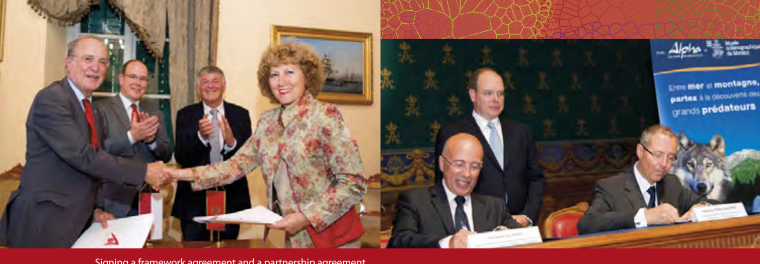
Signing a framework agreement and a partnership agreement